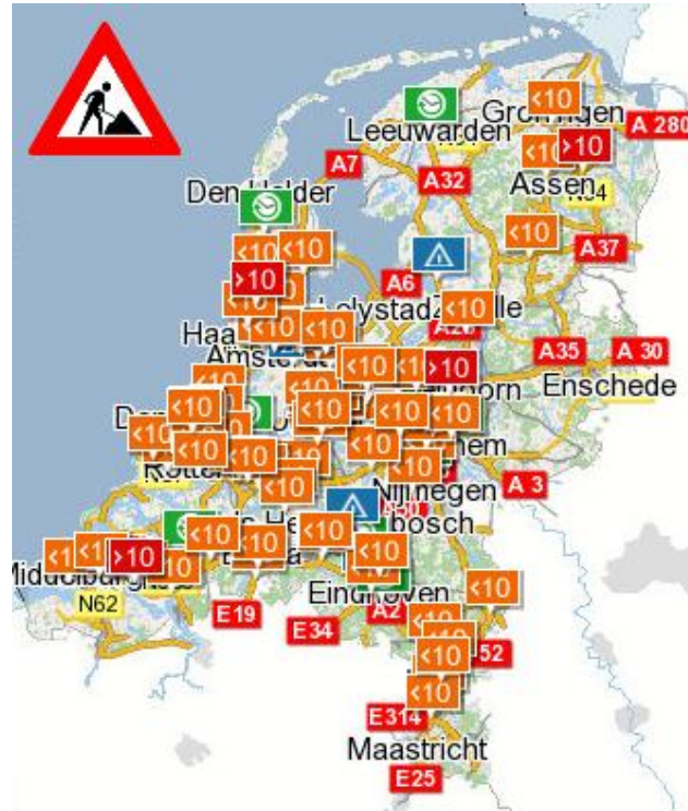
Road and Waterways