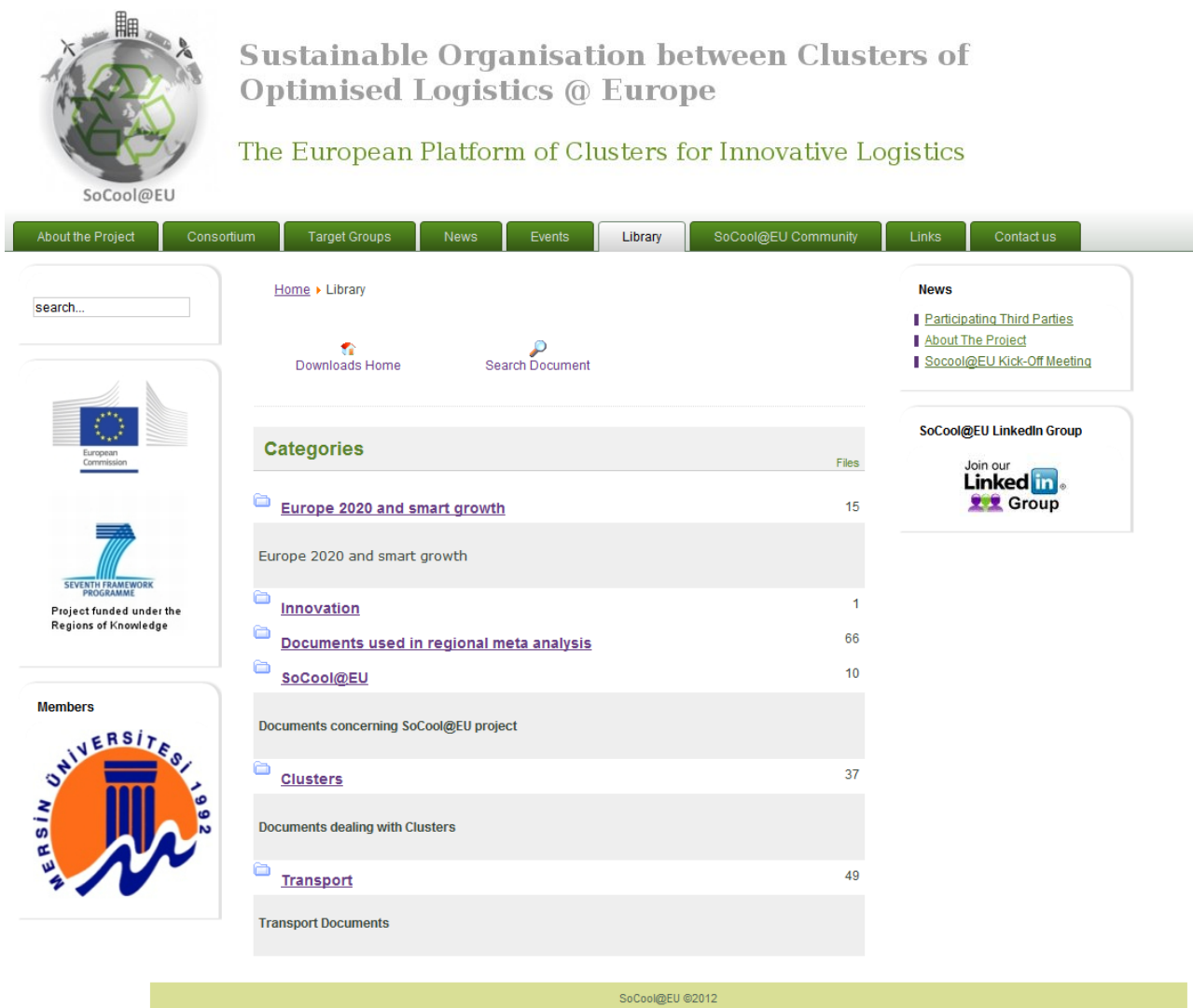
Figure 7: Library web page