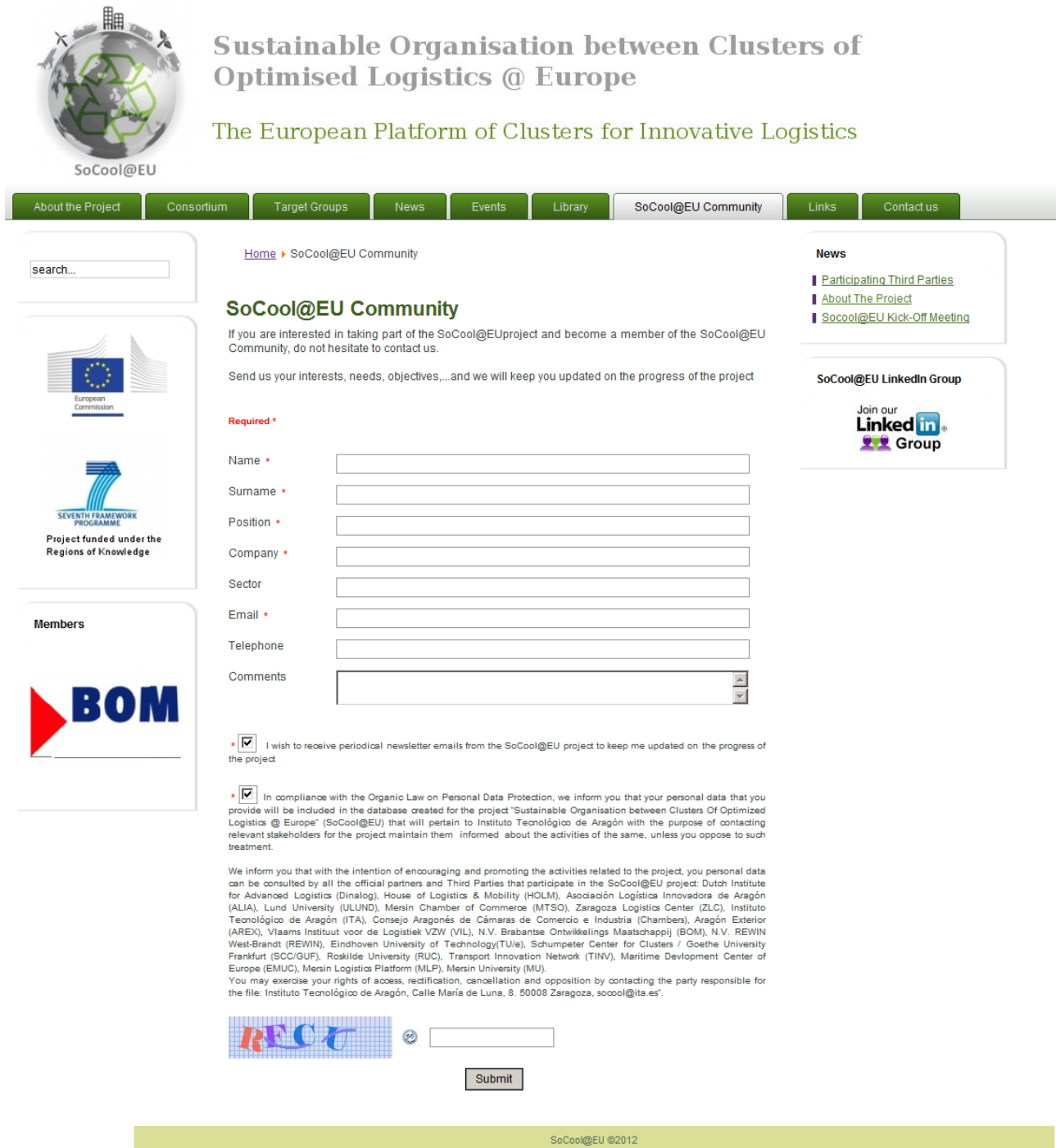
Figure 8: SoCool@EU community webpage