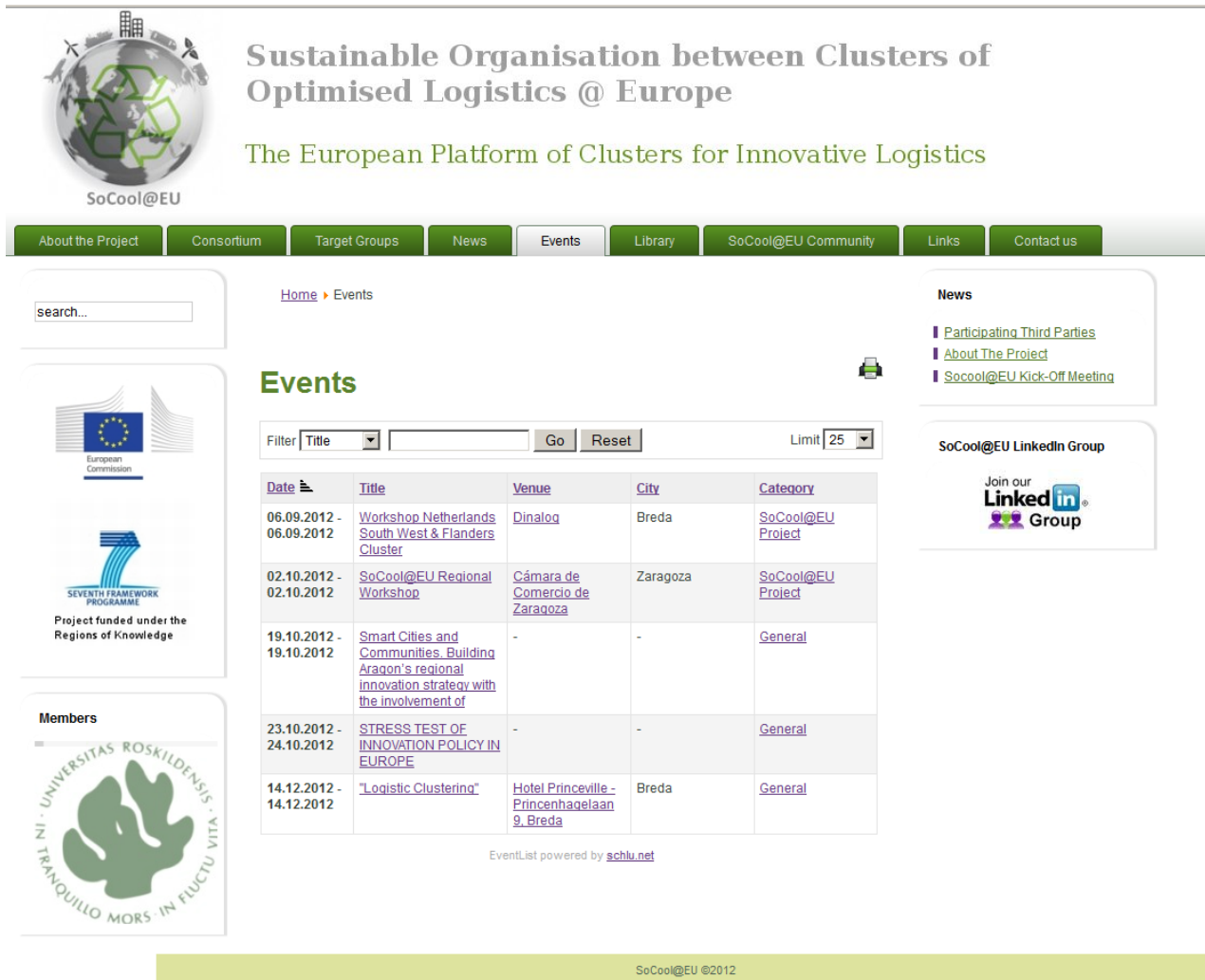
Figure 6: Events web page