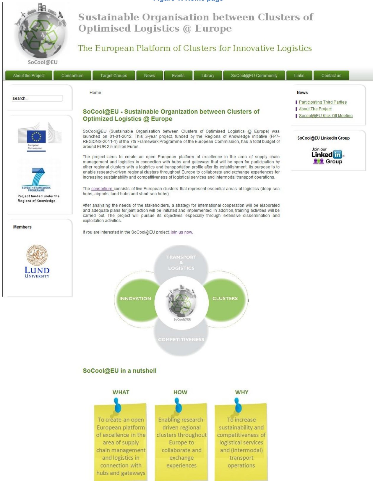
Figure 1: Home page