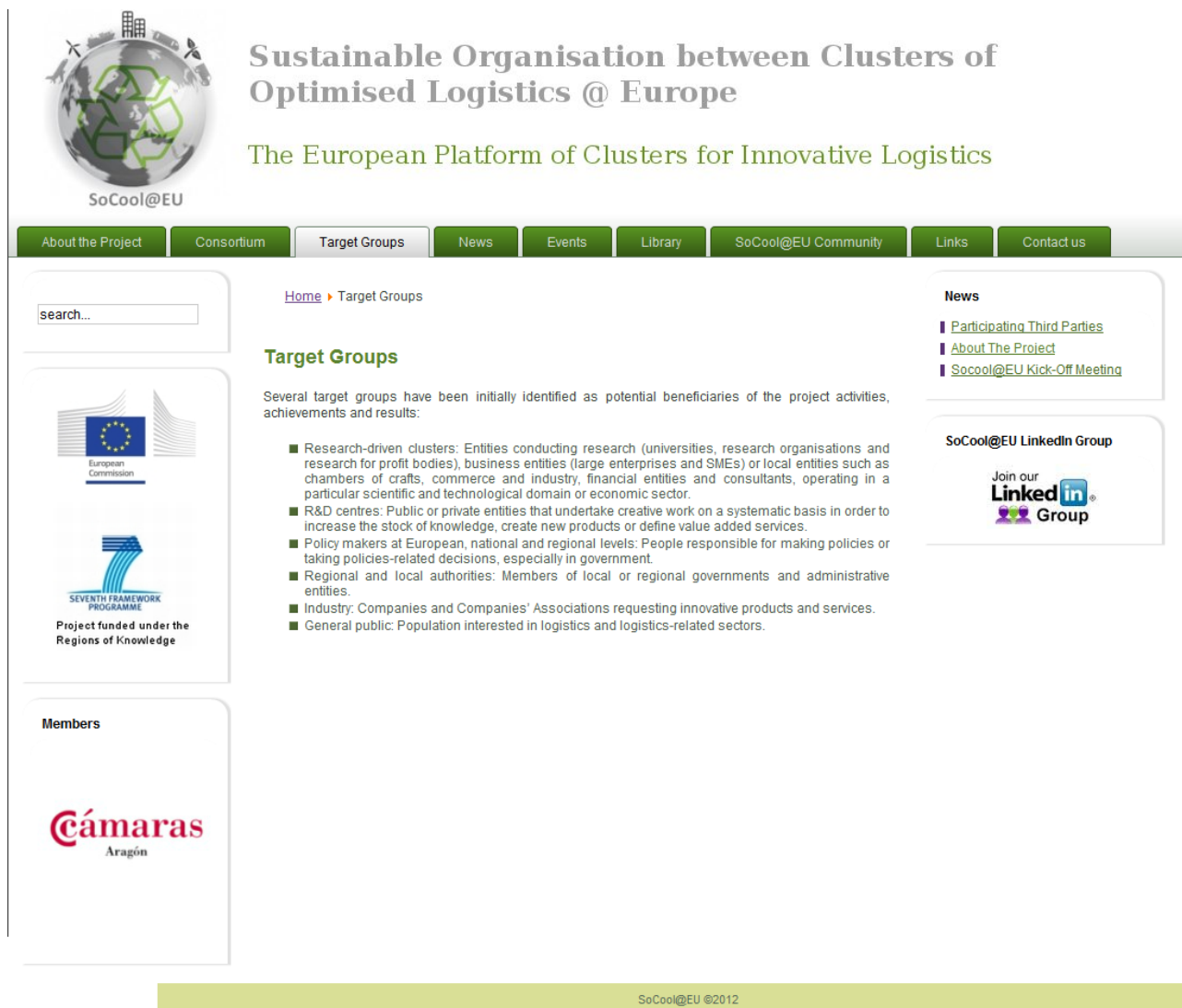
Figure 4: Target groups webpage